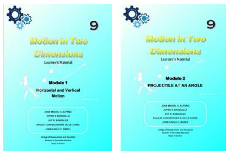
Figure 2. Front Cover of the Learning Module 1 and 2.

the standards and Most Essential Learning Competencies (MELCs) in the K-12 science curriculum required by the Department of Education, particularly in the 9 th grade. The content of module 1 was discussion on the independence of horizontal and vertical projectile motion while module 2 covers the relationship between the angle of projection and the height and range of the projected ball.